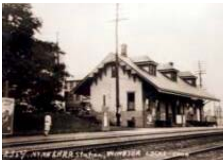
Windsor Locks Train Station circa 1920

Windsor Locks Preservation Association, Inc. "We're on the Right Track!"